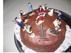
Pirates in battle