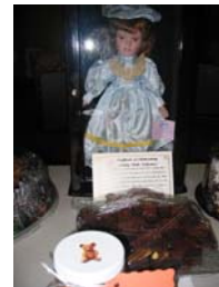
China doll w/ brownies