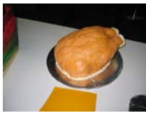
A Turkey Included a real one