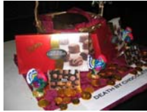
"Chocolate lovers" Chocolates